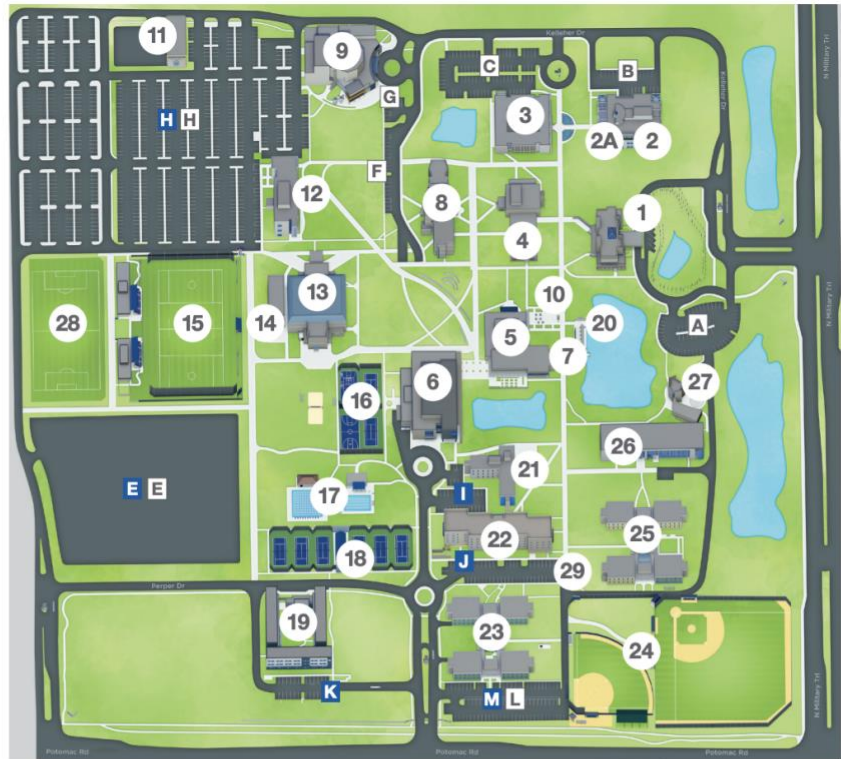
Lynn University Main Campus 3601 N. Military Trail, Boca Raton, FL 33431